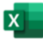
Microsoft Excel App