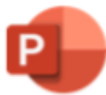
Microsoft PowerPoint App