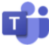
Microsoft Teams App

If you have a laptop or home PC you do not need to download any software to access Teams. If you are using a tablet or mobile device, you will need to download the following free apps: