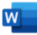
Microsoft Word App